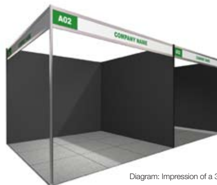
Diagram: Impression of a 3m x 3m

Outdoor Space only options exist for Exhibitors owning their own marquees. Rather than set sizes, the Outdoor Space only is designed to create a 'village feel' and is available in 3 X 3m (9m 2 ) blocks. Exhibitors are welcome to occupy any number of blocks they see necessary. Pricing is $500 / 9m 2 .