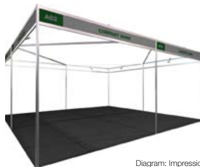
Diagram: Impression of a 6m x 6m