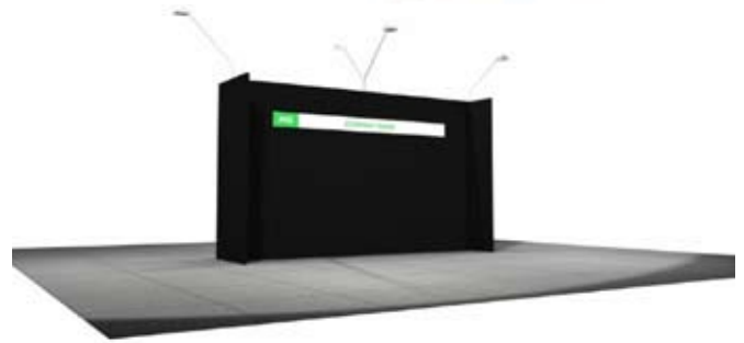
Diagram: Impression of Option 2; Island Stand. Refer to www.ausbike.com.au for more info.

Cost per each package option is $40 +gst per sqm in addition to the Stand price.